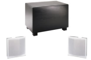
HOME THEATER LOUDSPEAKERS