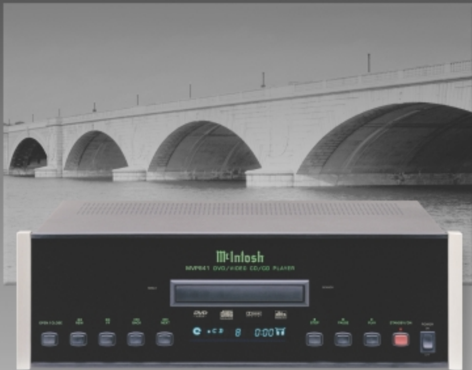
MVP841 DVD/CD/Video CD Player