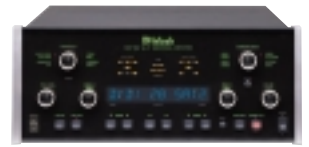
MX132 A/V CONTROL CENTER + PROCESSOR

PC4 AC Power Controller. The PC4 provides five AC outlets (four switched) for turning non-McIntosh components on and off automatically when it is connected to the power control output of a Control Center or Integrated Amplifier.