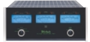
MC7205 5-CHANNEL POWER AMPLIFIER