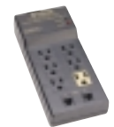
PC4 AC POWER CONTROLLER